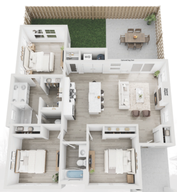
SCORIA - 1,249 SF 3 BED X 2 BATH